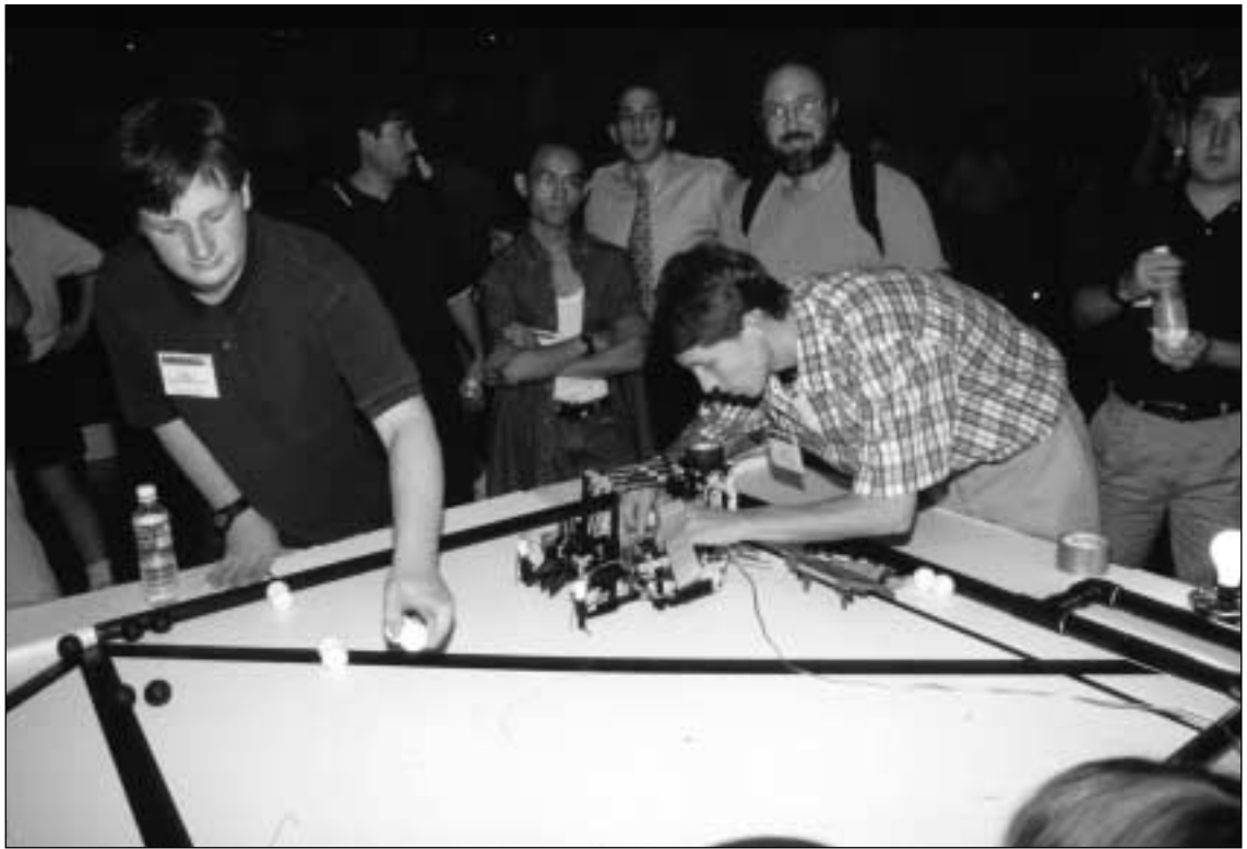
Figure 9. The Botball Tournament.

produced MINOTAURUS, a remarkable robot that played the game brilliantly, scooping up Ping-Pong balls in its rotating combinelike collector on one end; passing the balls into a holding chamber; seeking the goal zone; then depositing only the correctly colored balls into the high scoring position, ejecting its opponent's balls from the playing field. During the seeding rounds, MINOTAURUS achieved the maximum score all three times (no other team got the maximum even once).