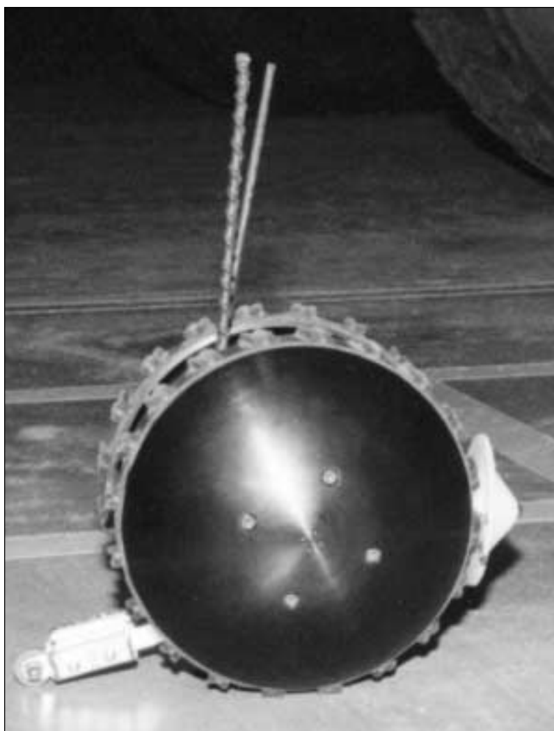
Figure 5. SUBOT, a Maneuverable, Indoor-Outdoor Robot.