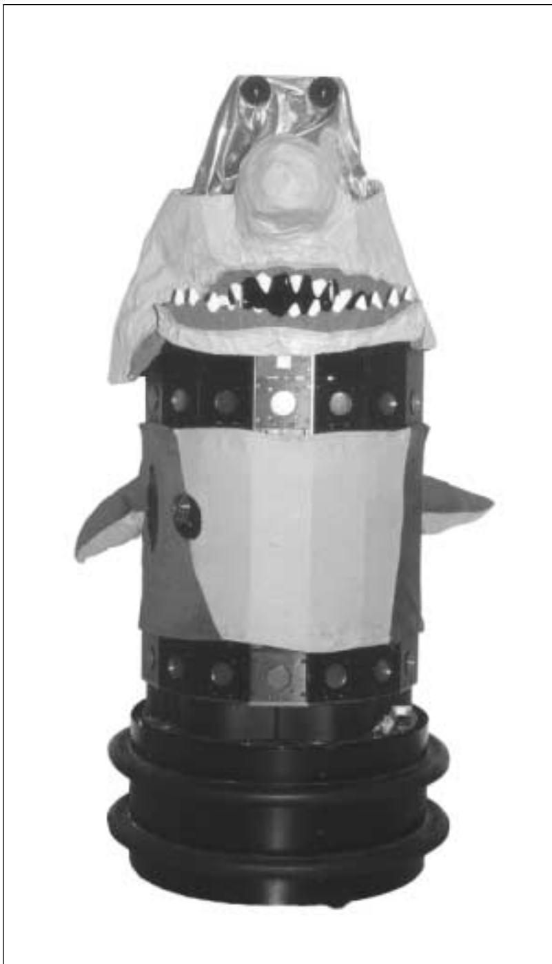
Figure 1. BUTLER the Borg Fish.

reluctant partner who refilled the SHARK's tray when summoned. This team was the first to ever bring a sewing machine to the contest! The BORG SHARK and the PUFFER FISH received a Technical Innovation Award for conceptual and artistic design.