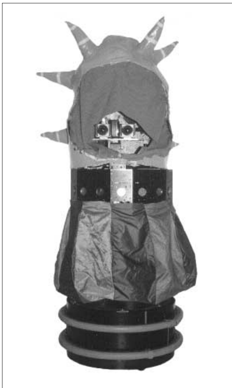
Figure 2. LEGUIN the Puffer Fish.

USC's entry, FOOF, uses an interactive, behavior-based solution to the navigation task. Their robot carries a florescent orange-colored arrow that humans can use to point it in the right direction. When the arrow is lifted from the bracket that holds it, a sensor switch notifies the robot. It then looks for the arrow and uses a reactive strategy to align with it. Once the