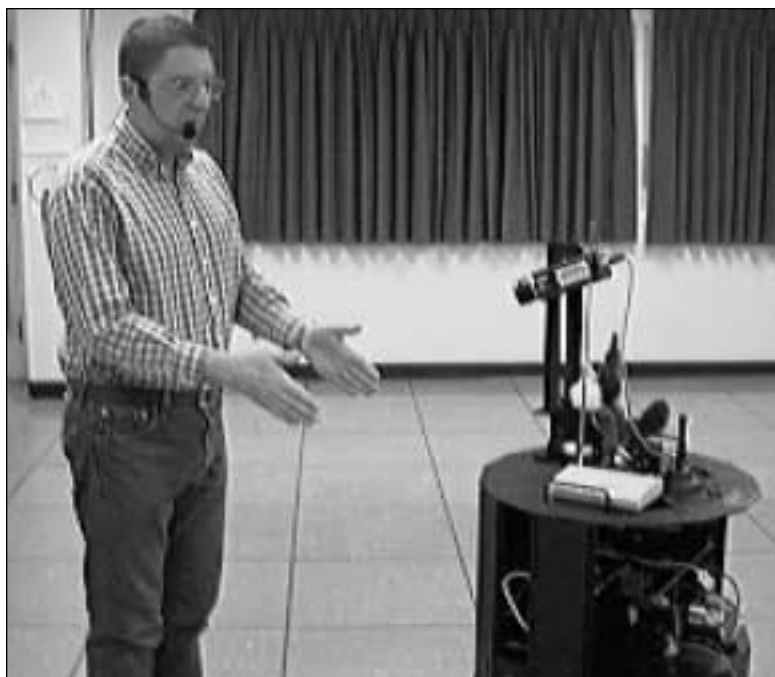
Figure 8. COYOTE Recognizing Gestures.

Botball is a national program of the KISS Institute for Practical Robotics. It is designed to get middle and high school students excited about science, math, and technology and help them develop skills and learn more about engineering, AI, and computer science. Botball also offers a vision of a rewarding career path in technology that students might not have considered previously.