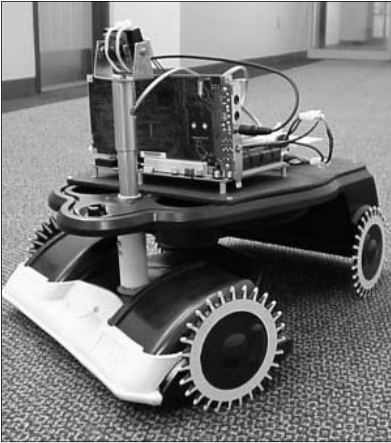
Figure 6. MINNOW, Based on CYE.

One major theme evidenced in this exhibit was an increased trend toward robot-human interactions. In the 1998 exhibit, several robots showed human-centered capabilities, and this year continued and expanded this theme.