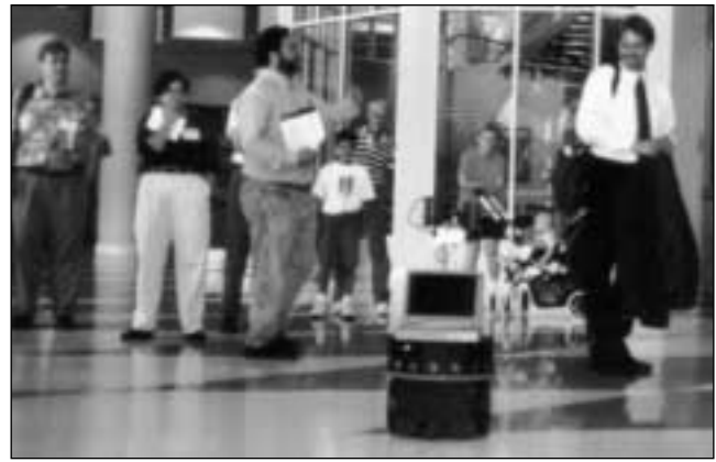
Figure 3 (left). ALFRED the Penguin Butler.